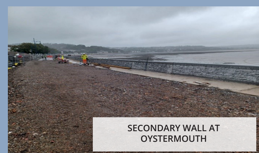
SECONDARY WALL AT OYSTERMOUTH