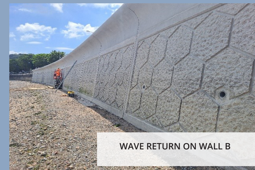
WAVE RETURN ON WALL B