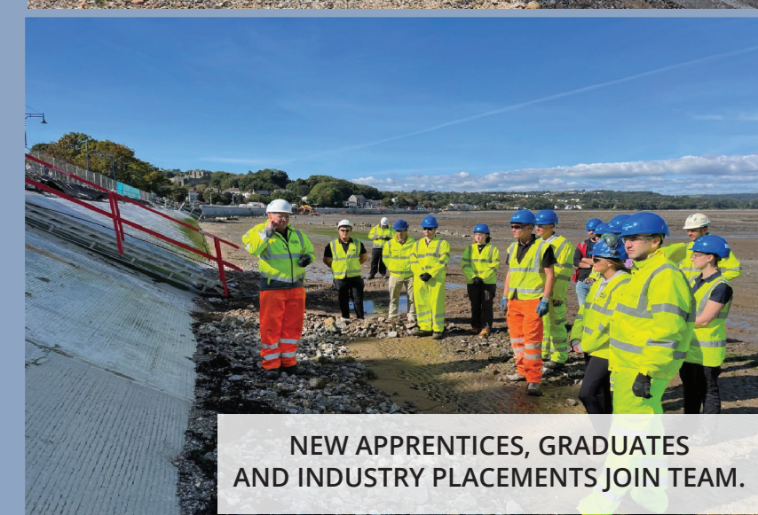
NEW APPRENTICES, GRADUATES AND INDUSTRY PLACEMENTS JOIN TEAM.