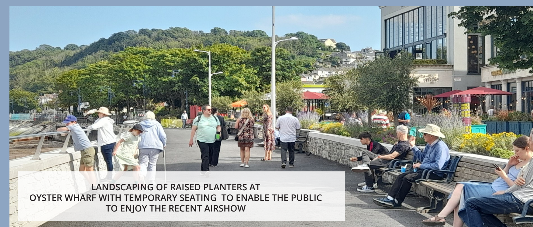
LANDSCAPING OF RAISED PLANTERS AT OYSTER WHARF WITH TEMPORARY SEATING TO ENABLE THE PUBLIC TO ENJOY THE RECENT AIRSHOW