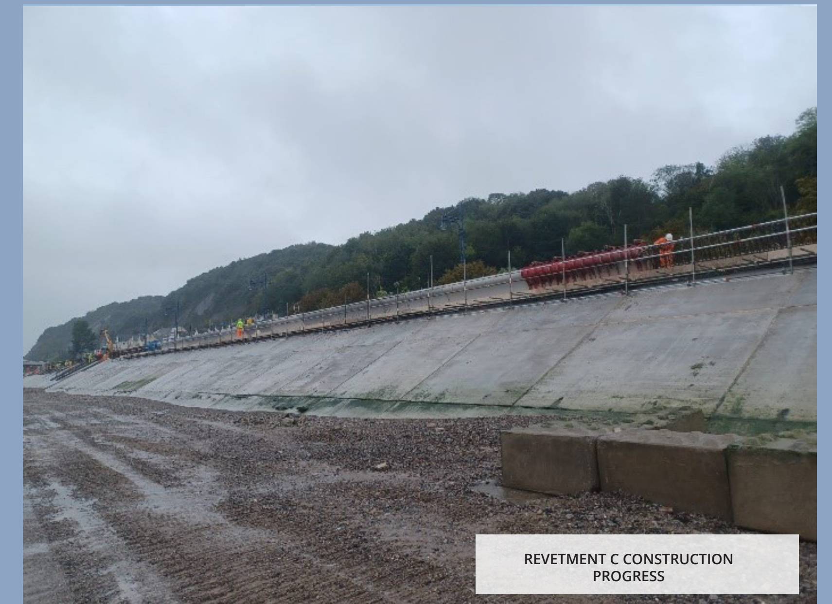
REVETMENT C CONSTRUCTION PROGRESS