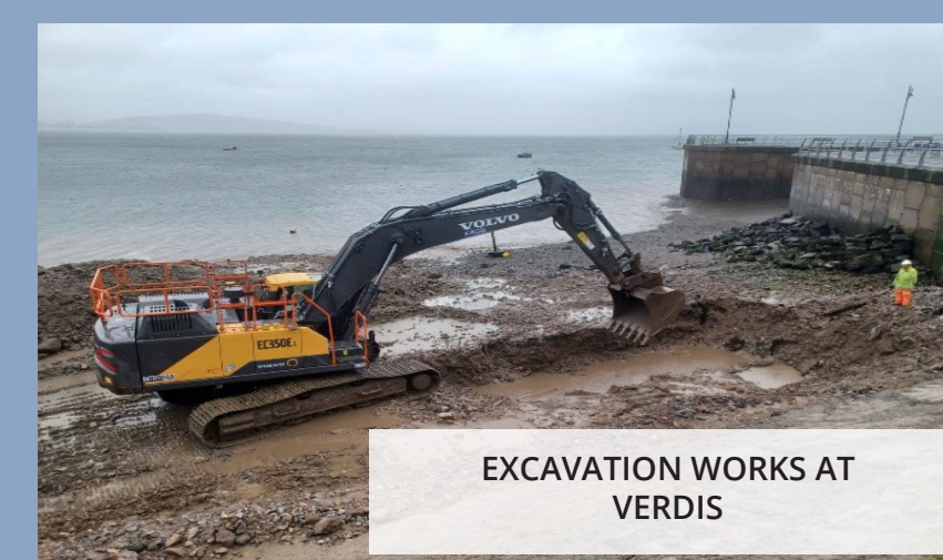
EXCAVATION WORKS AT VERDIS